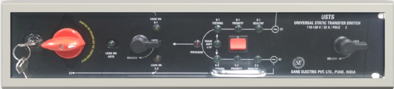
Automatic Transformer Switching Power Supply